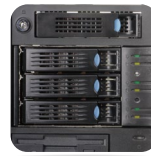
3 x 5.25" bays for ODD or storage kits