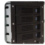
Removable HDD cage