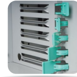
Screwless card retainer