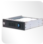
1 x 5.25" bay for ODD or SK31101