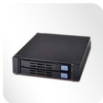
1 x 3.5" bay for FDD or SK51201