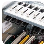
Adjustable card retainer for full height and low profile cards