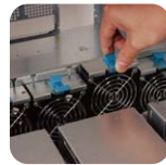
5 x middle 80mm hot-swap fans